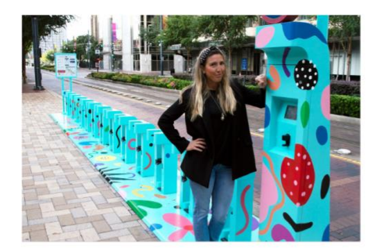
WHIMSY STATION By Shelby Nicole Main & Dallas

Existing Houston BCycle Art Stations: <u>https://www.houstonbcycle.com/art-station</u>